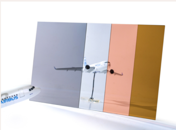
Integration of prints