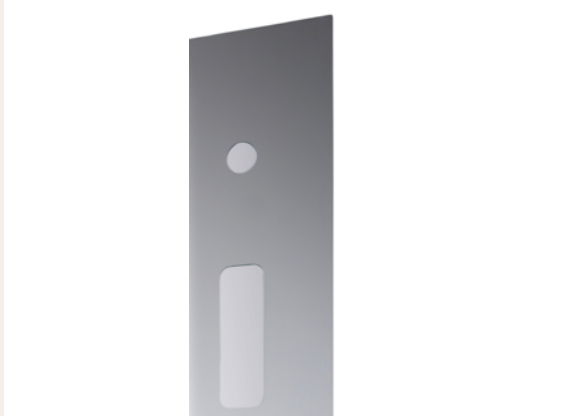
Integration of cut-outs